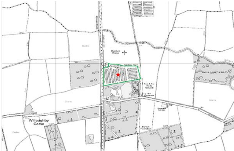
Installation boundary plan